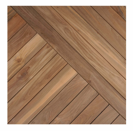
Style: Frank DeckTile