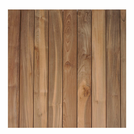
Style: Plank Deck Tile

Product: DeckTile Texture: Smooth Finish: Sand