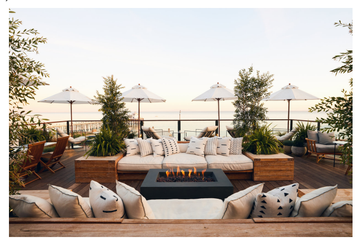
Luxury Villas, Gili Islands, Installed 2004