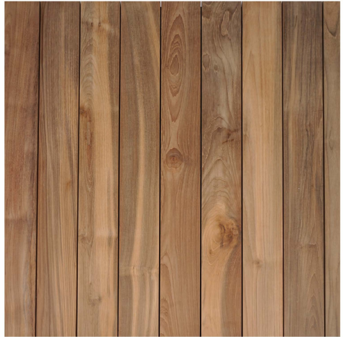
Style: Plank Deck Tile